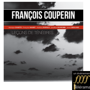
FRANÇOIS COUPERIN Leçons de ténèbres Hérisson - 2013