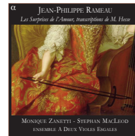
JEAN-PHILIPPE RAMEAU Les Surprises de l'Amour Alpha - 2011