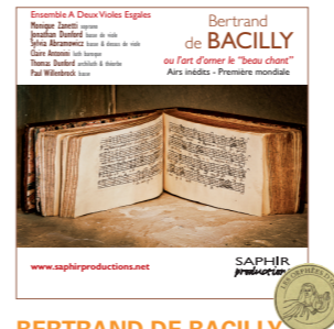
BERTRAND DE BACILLY ou l'art d'orner le beau chant Saphir Productions - 2012